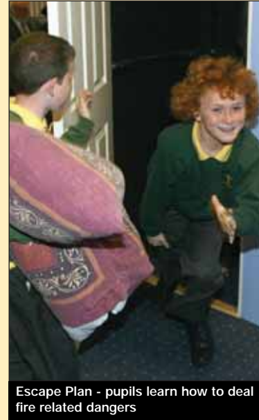
Escape Plan - pupils learn how to deal with fire related dangers

More than 2,500 10 and 11-year-olds across Manchester and Trafford have benefited from CSEF's latest Crucial Crews.